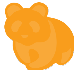
1/3 ISD in PP (0.41%+1% TiO 2 )