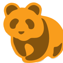
Full shade in PP (0.1%)